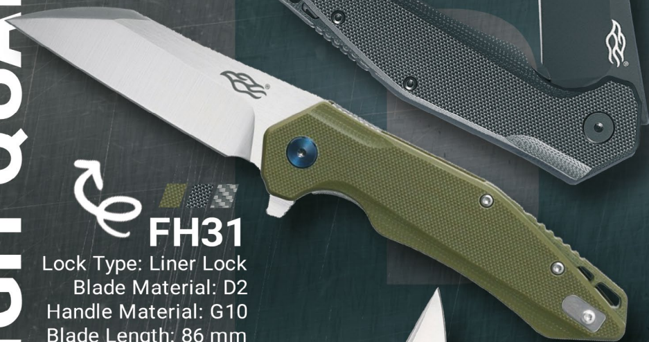
FH31 Lock Type: Liner Lock Blade Material: D2 Handle Material: G10 Blade Length: 86 mm Knife Weight: 113 g