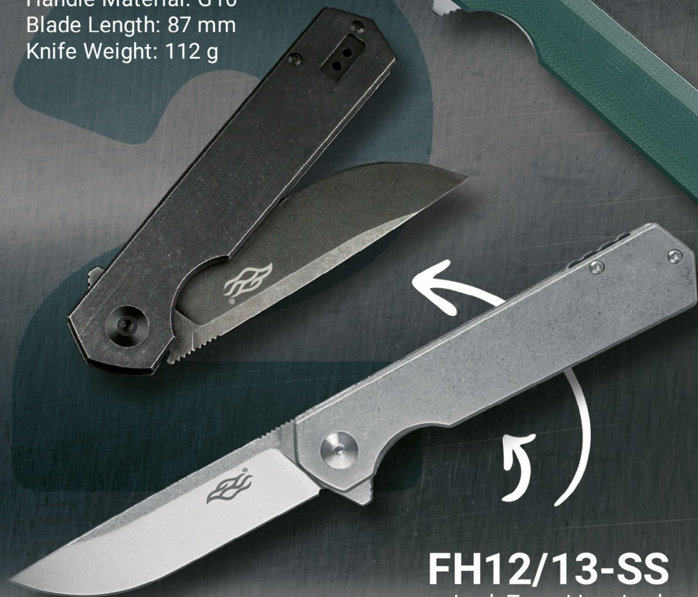
FH12/13-SS Lock Type: Liner Lock Blade Material: D2 Handle Material: Stainless Steel Blade Length: 87 mm Knife Weight: 114 g