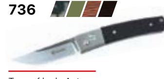
736 Type of lock: Auto Blade material: 440C (+58HRC) Handle material: G10 or wood Blade length: 81 mm Weight: 133 g