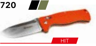
720 HIT Type of lock: G-lock Blade material: 440C (+58HRC) Handle material: G10 Blade length: 90 mm Weight: 205 g