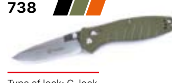
738 Type of lock: G-lock Blade material: 440C (+58HRC) Handle material: G10 Blade length: 89 mm Weight: 133 g