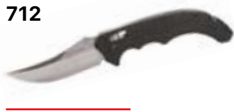
712 Type of lock: G-lock Blade material: 440C (+58HRC) Handle material: G10 Blade length: 95 mm Weight: 159 g