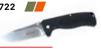
722 Type of lock: Frame lock Blade material: 440C (+58HRC) Handle material: G10 Blade length: 90 mm Weight: 225 g