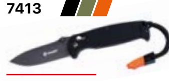
7413 Type of lock: G-lock Blade material: 440C (+58HRC) Handle material: G10 Blade length: 89 mm Weight: 150 g