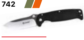
742 Type of lock: Frame lock Blade material: 440C (+58HRC) Handle material: G10 Blade length: 89 mm Weight: 162 g