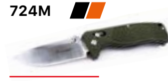
724M Type of lock: G-lock Blade material: 440C (+58HRC) Handle material: G10 Blade length: 80 mm Weight: 124 g