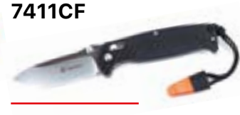
7411CF Type of lock: G-lock Blade material: 440C (+58HRC) Handle material: G10 Blade length: 89 mm Weight: 143 g