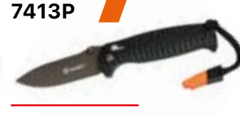
7413P Type of lock: G-lock Blade material: 440C (+58HRC) Handle material: G10 Blade length: 89 mm Weight: 150 g