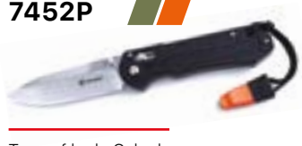
7452P Type of lock: G-lock Blade material: 440C (+58HRC) Handle material: G10 Blade length: 90 mm Weight: 147 g