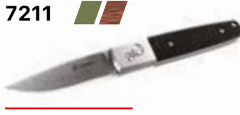
7211 Type of lock: Auto Blade material: 440C (+58HRC) Handle material: G10 or wood Blade length: 85 mm Weight: 135 g