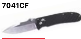
7041CF Type of lock: G-lock Blade material: 440C (+58HRC) Handle material: Carbon fibre Blade length: 86 mm Weight: 147 g