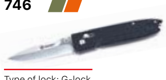
746 Type of lock: G-lock Blade material: 440C (+58HRC) Handle material: G10 Blade length: 85 mm Weight: 111 g