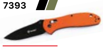
7393 Type of lock: G-lock Blade material: 440C (+58HRC) Handle material: G10 Blade length: 87 mm Weight: 134 g