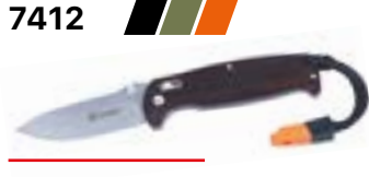
7412 Type of lock: G-lock Blade material: 440C (+58HRC) Handle material: G10 or wood Blade length: 89 mm Weight: 150 g