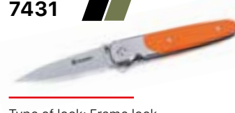
7431 Type of lock: Frame lock Blade material: 440C (+58HRC) Handle material: G10 Blade length: 87 mm Weight: 130 g