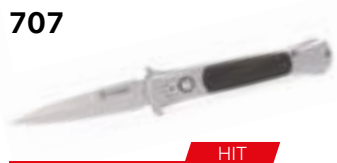
707 HIT Type of lock: Button lock Blade material: 440C (+58HRC) Handle material: Aluminum. Blade length: 90 mm Weight: 135 g