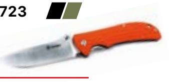
723 Type of lock: Frame lock Blade material: 440C (+58HRC) Handle material: G10 Blade length: 95 mm Weight: 180 g