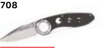
708 Type of lock: Liner lock Blade material: 440C (+58HRC) Handle material: G10 Blade length: 81 mm Weight: 150 g