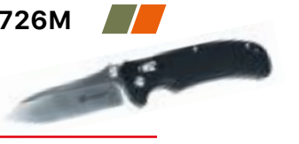
726M Type of lock: G-lock Blade material: 440C (+58HRC) Handle material: G10 Blade length: 85 mm Weight: 119 g