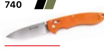
740 Type of lock: G-lock Blade material: 440C (+58HRC) Handle material: G10 Blade length: 95 mm Weight: 155 g