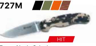
727M HIT Type of lock: G-lock Blade material: 440C (+58HRC) Handle material: G10 or wood Blade length: 89 mm Weight: 130 g