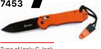
7453 Type of lock: G-lock Blade material: 440C (+58HRC) Handle material: G10 Blade length: 90 mm Weight: 147 g