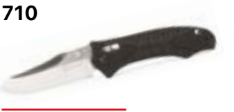
710 Type of lock: G-lock Blade material: 440C (+58HRC) Handle material: G10 Blade length: 82 mm Weight: 160 g