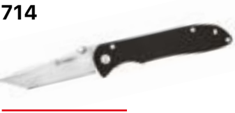
714 Type of lock: Liner lock Blade material: BRD 4116 Handle material: : G10 Blade length: 85 mm Weight: 111 g