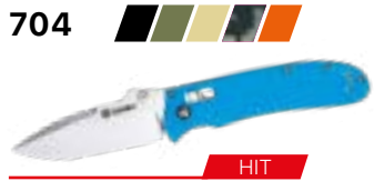
704 HIT Type of lock: G-lock Blade material: 440C (+58HRC) Handle material: G10 Blade length: 86 mm Weight: 147 g