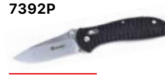
7392P Type of lock: G-lock Blade material: 440C (+58HRC) Handle material: G10 or wood Blade length: 89 mm Weight: 139 g