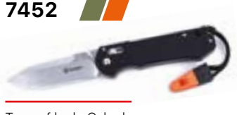
7452 Type of lock: G-lock Blade material: 440C (+58HRC) Handle material: G10 Blade length: 90 mm Weight: 150 g